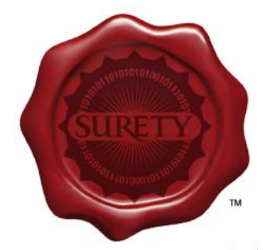
Think of us as the modern-day "Digital Wax Seal"

For more information about OpenLAB ELN, visi<u>t www.agilent.co</u>m.